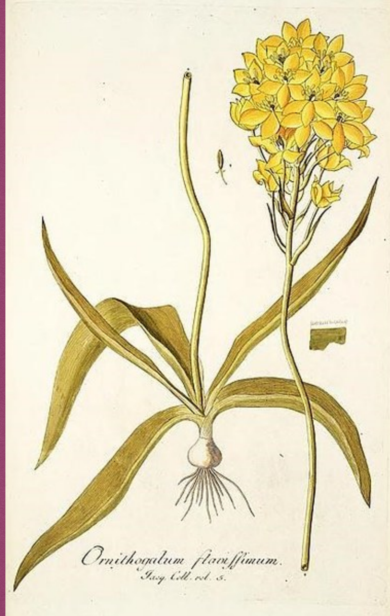
Ornithogalum flavissimum. Juss. Coll. vol. 5.

We are also looking at links between knowledge exchange and sustainability , building on the Student-led Knowledge Exchange (SLKE) project at Marjon. Key components of the SLKE model include co-production of knowledge, experiential learning, active participation and transformative learning, all of which are considered important in sustainability pedagogy. We are interested in thinking about how we might open up opportunities for Marjon students to have a direct impact on green economic recovery by working with local partners and community groups. Get in touch if you have any ideas or any examples you'd like to share.